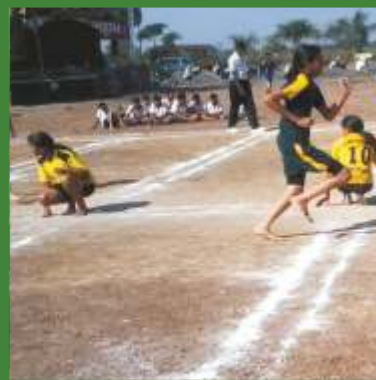
CBSE Kho Kho Matches