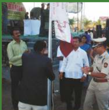
Inauguration of CBSE Matches by Commissioner of Police (Amravati)